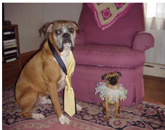
Halloween can be a trick or a treat for pets

For more information about holiday safety for pets, call or visit your family veterinarian. Remember, your veterinarian is your very best source for advice on keeping your pet safe, healthy, and happy all year long. Visit www.avma.org for additional information about pet safety.