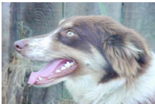
Make dental care a priority for kissable breath.