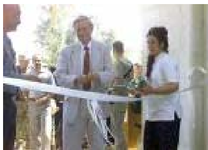
Reopening of the Baghdad Zoo