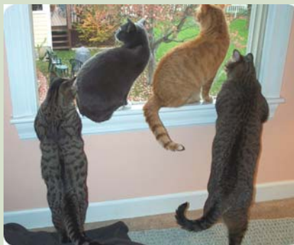
Cats are the most popular pet and yet researchers tend to overlook them.

Olson is encouraging clients to speak up for cats and tell their veterinarians, particularly those who are at veterinary teaching institutions, to submit proposals to learn more about feline health.